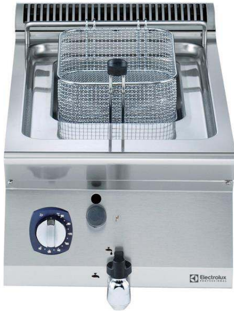
371422 (E7KKBTAOMCI) 7-lt gas Fryer Top with 1 "V" shape well (external burners), 1 basket and lid included, Q Mark